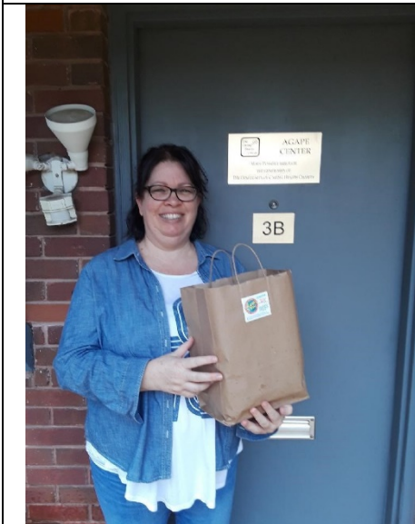
Agape Center Helps women, moms and children facing situational homelessness.