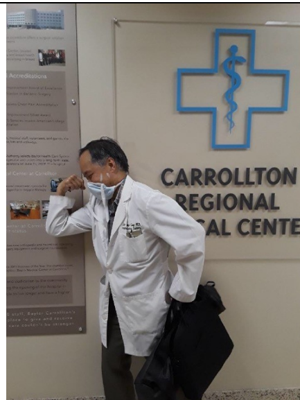
Carrollton Regional Medical Center